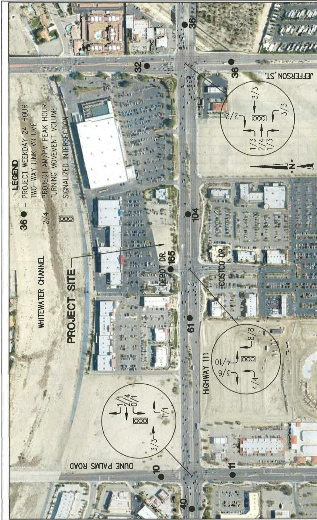
FIGURE 5 PROJECT AM/PM PEAK HOUR TURNING MOVEMENT AND DAILY ROADWAY LINK VOLUMES

AMERICAN TIRE DEPOT FOCUSED TRAFFIC IMPACT MEMORANDUM LA QUINTA, CA