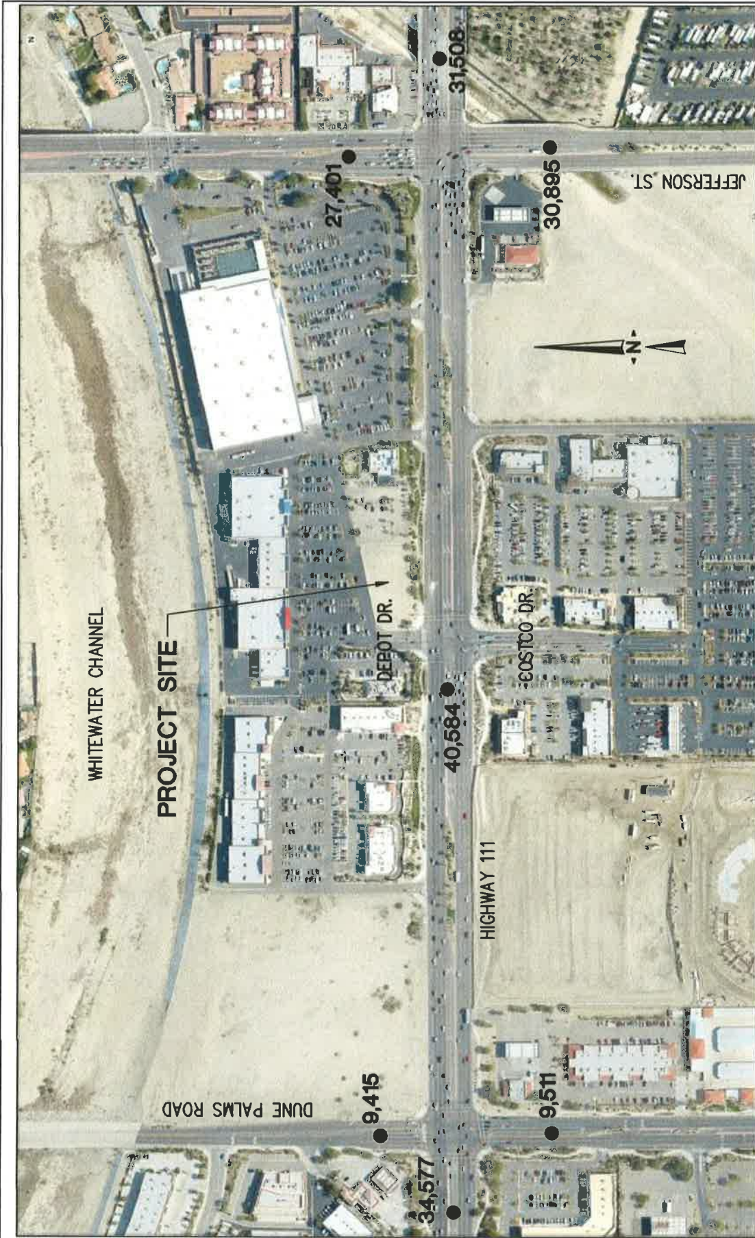
FIGURE 2 EXISTING WEEKDAY DAILY TRAFFIC VOLUMES SURROUNDING PROJECT SITE

AMERICAN TIRE DEPOT FOCUSED TRAFFIC IMPACT MEMORANDUM LA QUINTA, CA